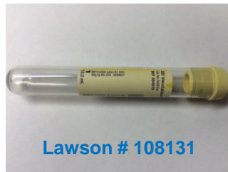
Lawson # 108131