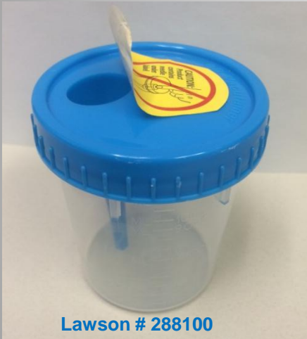
Lawson # 288100