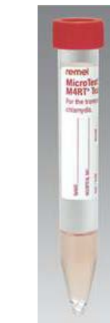
M4 Transport Media