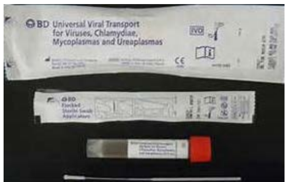
BD Universal Transport Kit (includes swab)