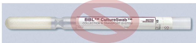
Standard culture swab (single)

Unacceptable Specimen Type: All other swab types