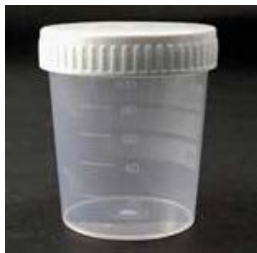
Sterile urine cup (In-patients)