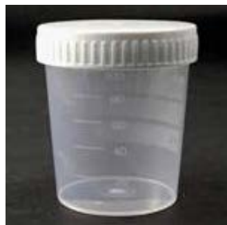
Wide-mouth leak-proof container Inpatients