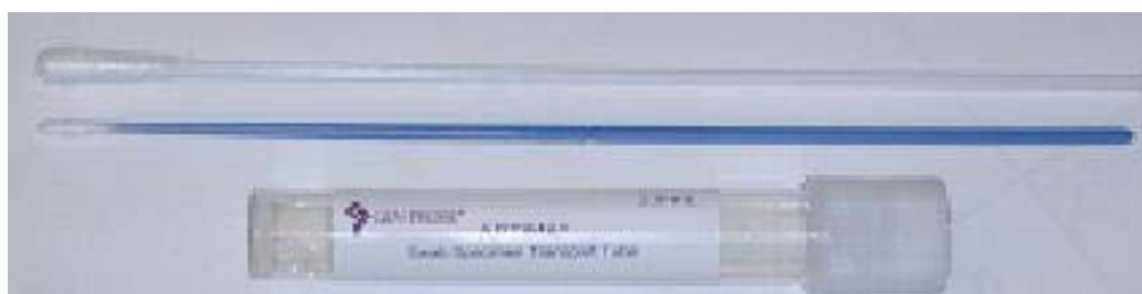
Gen-Probe Aptima Swab Collection Tube