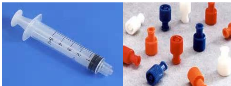
Syringe chamber, capped with needles removed

All containers labeled with contents and collection site