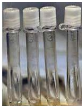
CSF Fluid Tubes

Specify whether sample is from ventricles or lumbar puncture