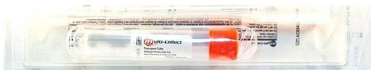
Abbott Multi-collect Device (urine or enclosed swab)