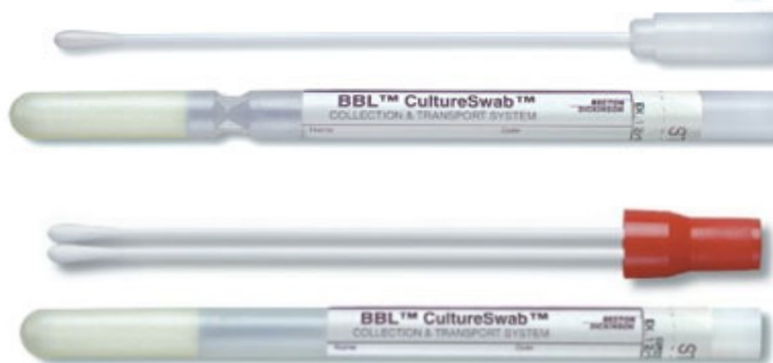
General use culture swab (single or double*)