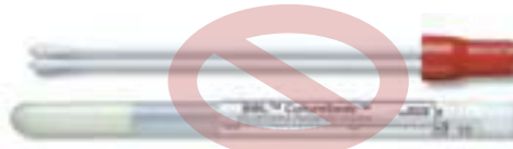
Standard culture swab (double)