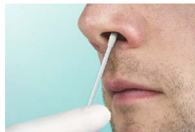
Method of Collection