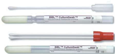
General use Culture swab