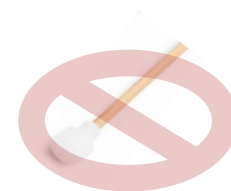
Wooden shaft swab