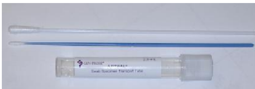
Gen-Probe Aptima Swab Collection Tube