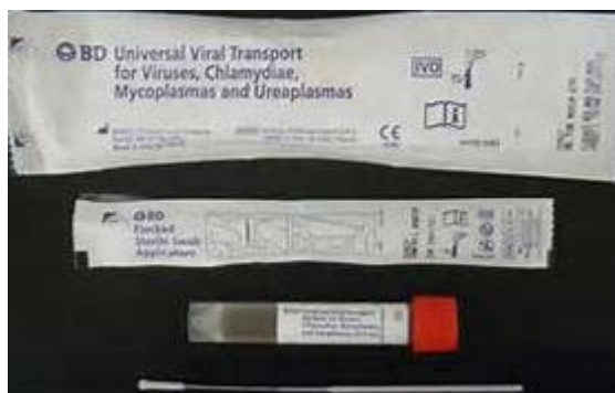
BD Universal Transport Kit (includes swab)