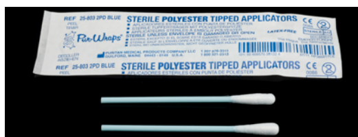
Polyester-tip Swab (rapid antigen testing only)