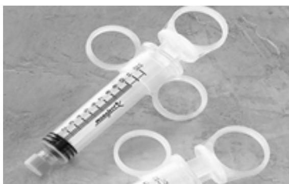
Nasopharyngeal Aspirate Device