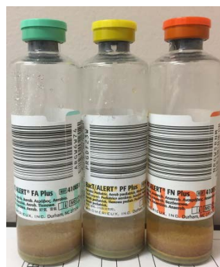
BacT Alert Blood bottles (peritoneal and joint fluids ONLY)