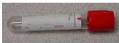
Red top Vacutainer Tube