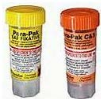
SAF (yellow) and Carey Blair (Orange) Para-Paks Outpatients