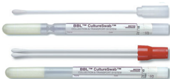
General use Culture swab