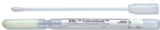
General use culture swab

Consider decontamination of commensal organisms prior to swabbing